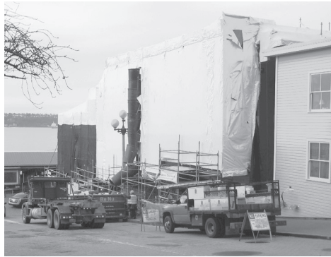
Scaffolding and white shrink wrap will be in place on the south side of the Stewart House until late February or early March.

ing, with scaffolding now in place on the Stewart Street side of the building. Additional work was needed on the building's connection to the canopy.